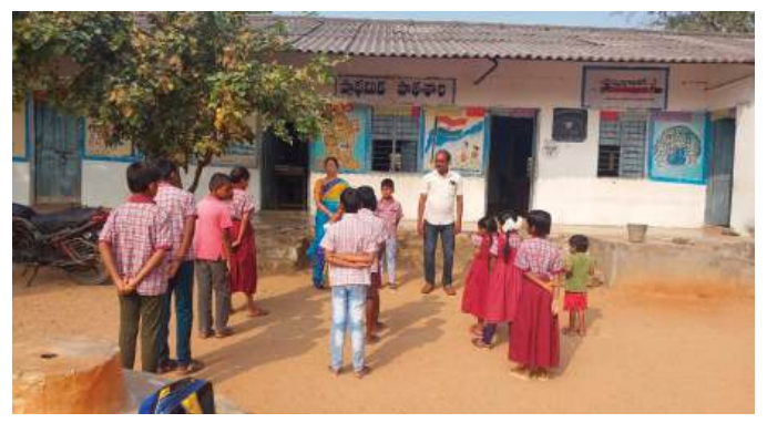
Students in prayer at MPPS, Karimnagar District

and children with disabilities. However, challenges such as inadequate infrastructure, lack of transportation, insufficient funding for digital tools, library resources, and sports equipment were identified. Addressing these issues is essential to enhance the scheme's overall impact and effectiveness.