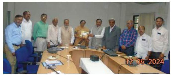
An interactive session with the 5<sup>th</sup> State Finance Commission, Karnataka

3. Interactive Session with Karnataka's 5th State Finance Commission