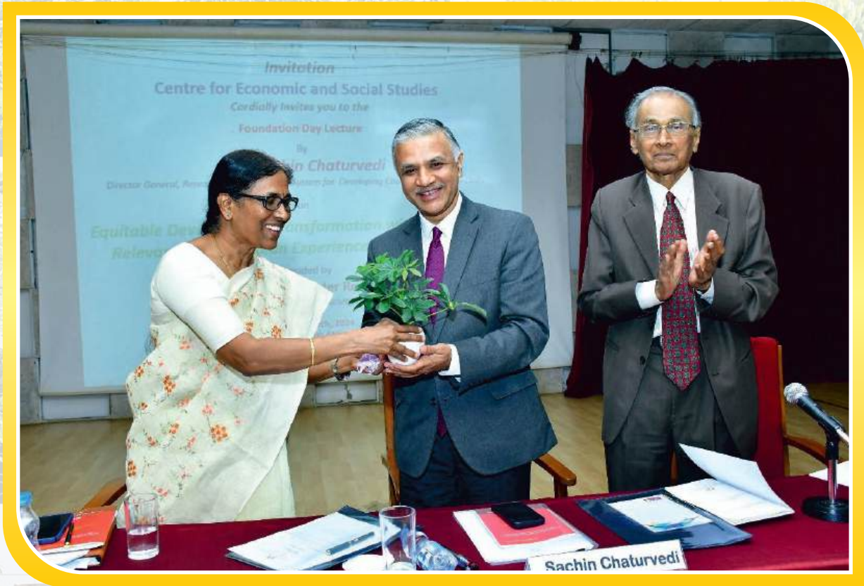
➤ The 6th Foundation Day Lecture on 1st March, 2024