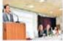
అంతర్జాతీయ ప్రమాణాలకు అనుగుణంగా ఉన్నత విద్య బోధనా ప్రణాళికను ప్రభుత్వం తీసుకువచ్చింది.

ప్రపంచీకరణకు అనుగుణంగా ఉన్నత విద్య బోధనా ప్రణాళికను ప్రభుత్వం తీసుకువచ్చింది. అంతర్జాతీయ ప్రమాణాలకు అనుగుణంగా ఉన్నత విద్య బోధనా ప్రణాళికను ప్రభుత్వం తీసుకువచ్చింది. విద్యార్థుల అభివృద్ధికి అనుగుణంగా ఉన్నత విద్య బోధనా ప్రణాళికను ప్రభుత్వం తీసుకువచ్చింది.