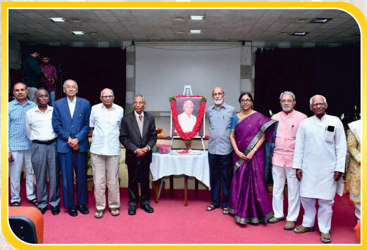
➤ The 18th Waheeduddin Khan Memorial Lecture on 30th January, 2024