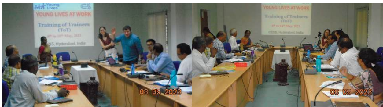
Young Lives Project Team from United Kingdom (UK)

In the seventh round, the thrust is given to education and skills, employment, family lives, health, and well-being. The research project can now track skills development and educational and learning journeys from infancy to early adulthood. Our comprehensive data allows us to evaluate the causes and consequences of inequality in education and learning and how this affects securing work and family formation by exploring individual characteristics, skills and aspirations, family circumstances and expectations,