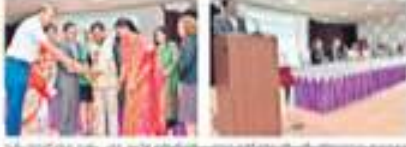
అంతర్జాతీయ ప్రమాణాలకు అనుగుణంగా ఉన్నత విద్య బోధనా ప్రణాళికను ప్రభుత్వం తీసుకువచ్చింది.

• విద్యార్థుల అభివృద్ధికి అనుగుణంగా ఉన్నత విద్య బోధనా ప్రణాళికను ప్రభుత్వం తీసుకువచ్చింది. • అంతర్జాతీయ ప్రమాణాలకు అనుగుణంగా ఉన్నత విద్య బోధనా ప్రణాళికను ప్రభుత్వం తీసుకువచ్చింది.