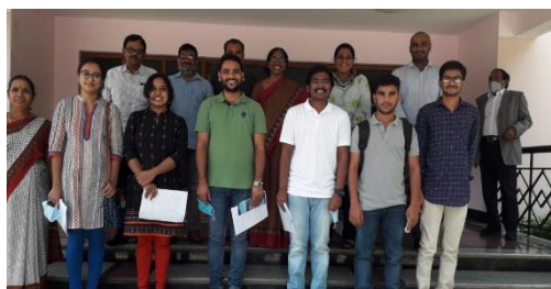
New batch 2020-21 with DGS