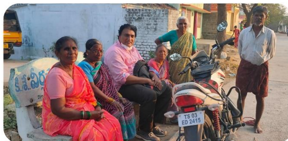
Researchers on their field work.