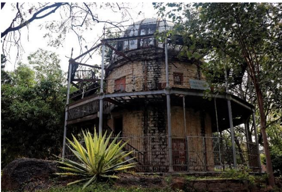
Iconic Nizamiah Observatory at CESS