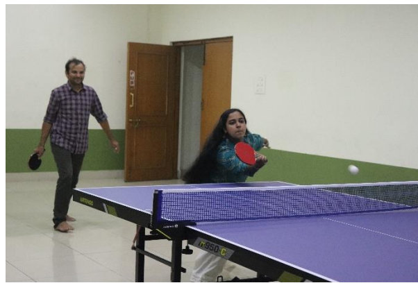
Table Tennis at CESS