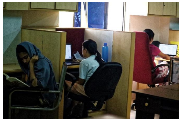
Scholar's study room at CESS