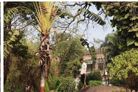
The Guardians of 'beauty of CESS'