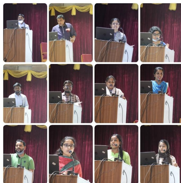
Scholars' presenting at the event of “Impact of COVID 19 on the economy.”