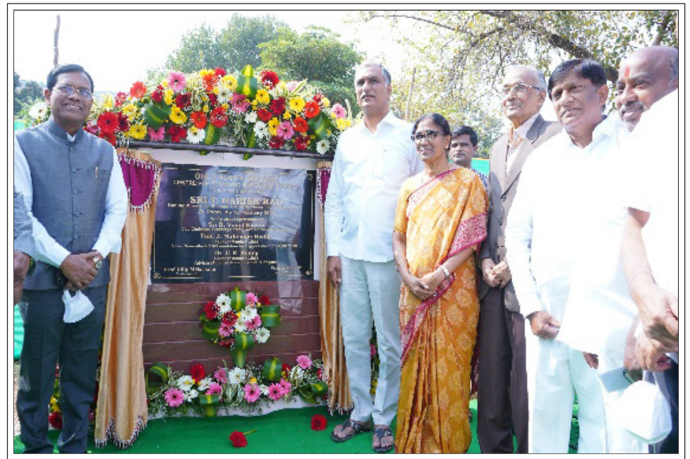
Girls Hostel Foundation Stone

CESS conducts remarkable sports and cultural competitions every year. The competition is not just about identity, it is about sharing friendships, culture, bonds, values, and many sweet memories and experiences.