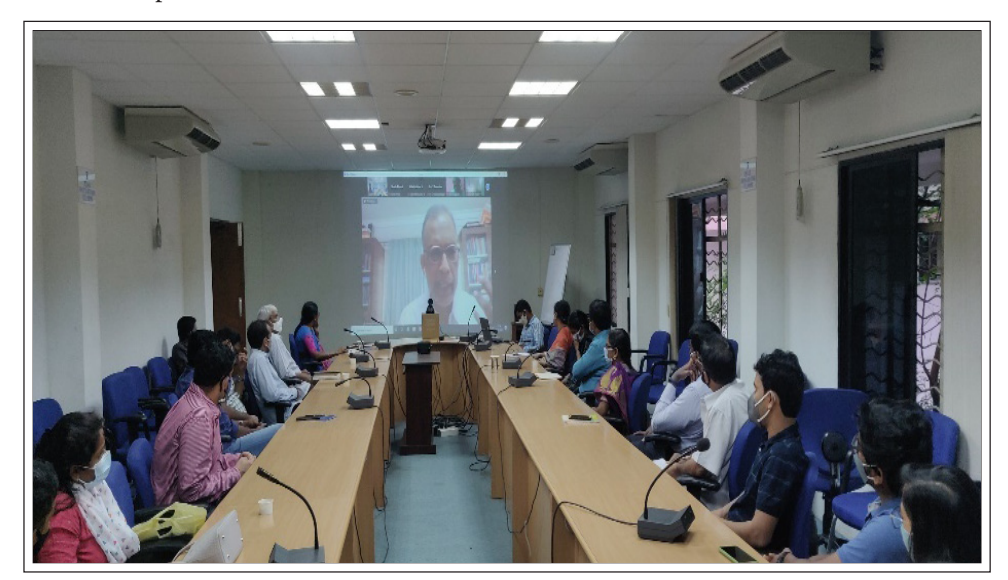
Induction programme of 2021-22 batch

Science/Public Administration, Sociology/Anthropology. The entrance test was conducted on 13 August 2022, oral test on 27 August, 2022. 11 candidates are selected for the year 2022-23.