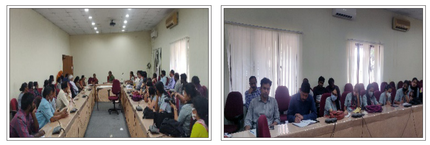
Women's Day Round Table Discussion