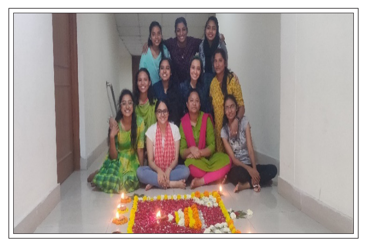
Flower diya decoration